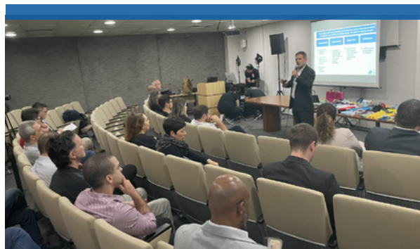
May 03rd | Federal Revenue Workshop São Paulo/SP | 55 Attendees