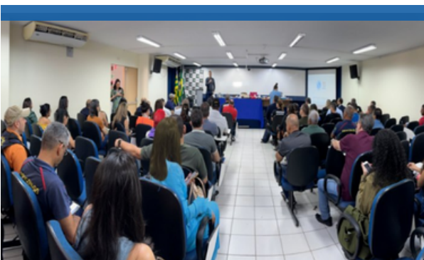
September 19th | PROCON Workshop Goiânia/GO | 68 Attendees