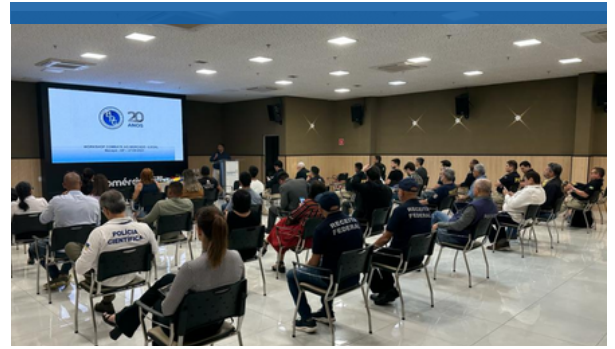
September 27th | PRF Workshop Macapá/AP | 48 Attendees