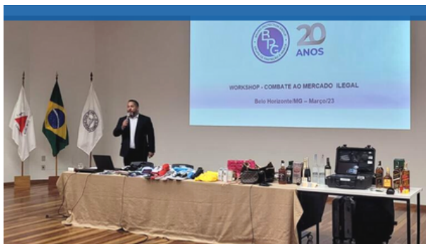
March 10th | PRF Workshop Belo Horizonte/MG | 61 Attendees