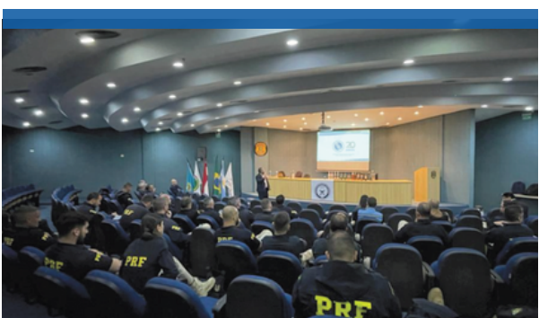
April 19th | PRF Workshop Foz do Iguaçu/PR | 48 Attendees