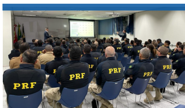
June 21st | PRF Workshop Florianópolis/SC | 82 Attendees