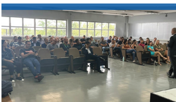
March 21st | Federal Revenue Workshop Porto Alegre/RS | 57 Attendees