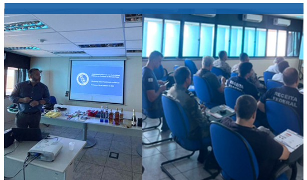
October 30th | BPG Workshop Fortaleza/CE | 28 Attendees