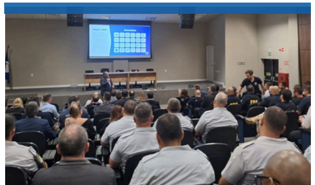
October 23rd | BPG Workshop Bauru/SP | 140 Attendees