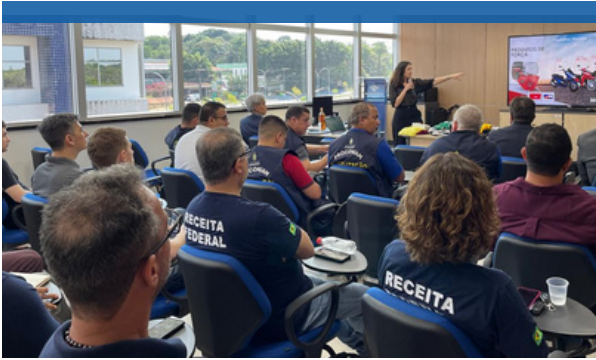
August 09th | BPG Workshop Manaus/AM | 43 Attendees