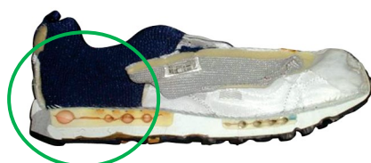
Original Damping System

Original tennis shoes have Damping Technology. In Nike Air tennis shoes, this technology consists in balls of air inside the sole. In counterfeit tennis shoes, even in those ones which are identified with the "AIR" term, there is no system of damping.