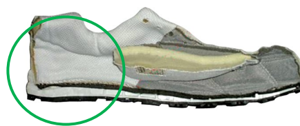
Counterfeit No Damping System

According to reports from the University of Santa Catarina and CTCAA (Footwear Technology Centre of Leather and similar) of Rio Grande do Sul State, counterfeit shoes such as the sample above manufactured in Nova Serrana, with no damping system, may cause injury to joints such as early arthrosis.