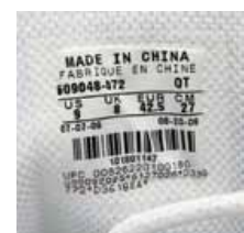
Tongue label (new)